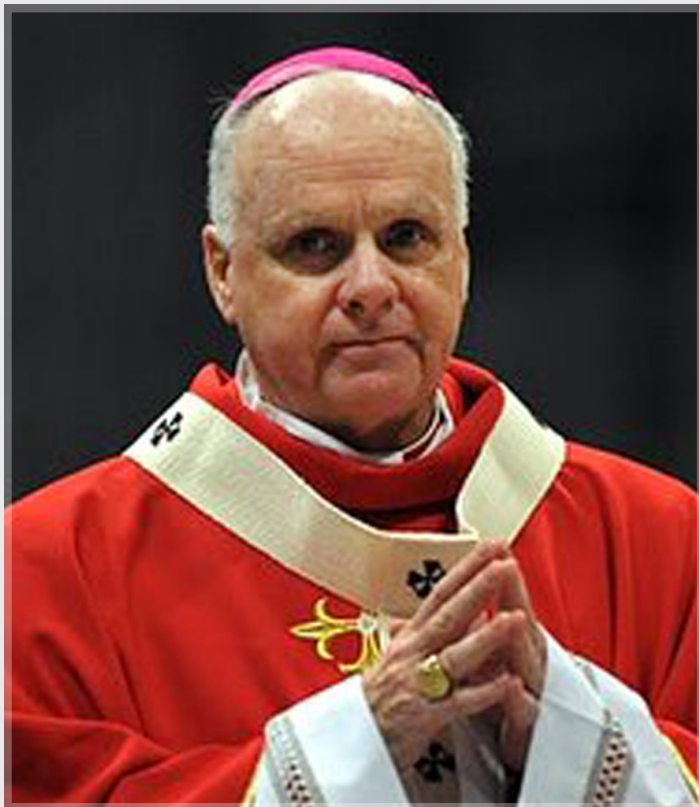
the Most Reverend Edwin Frederick O'Brien