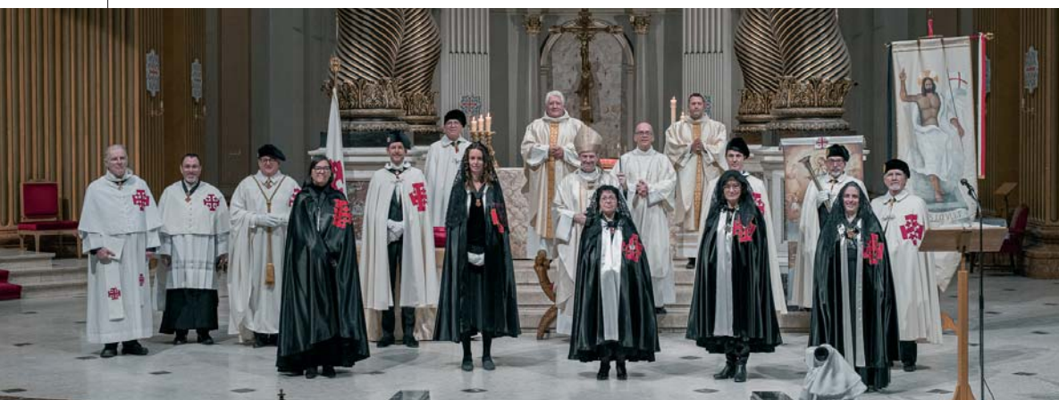
Investiture of Knights and Dames in the Canada-Montreal Lieutenancy.