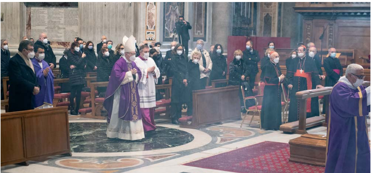
The funeral of the Lieutenant General of Honour was presided over by Cardinal Pietro Parolin, Secretary of State of His Holiness Pope Francis.