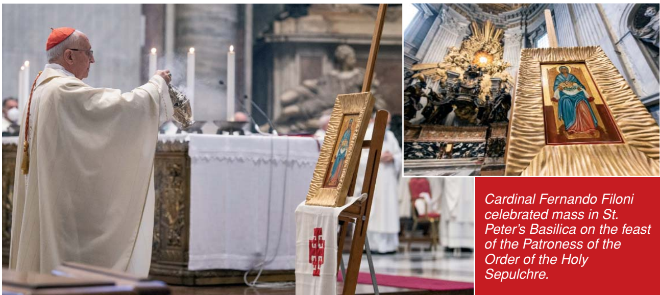
Cardinal Fernando Filoni celebrated mass in St. Peter's Basilica on the feast of the Patroness of the Order of the Holy Sepulchre.

The Grand Magisterium's meeting took place the following day, virtually, under the coordination of Governor General Leonardo Visconti di Modrone.