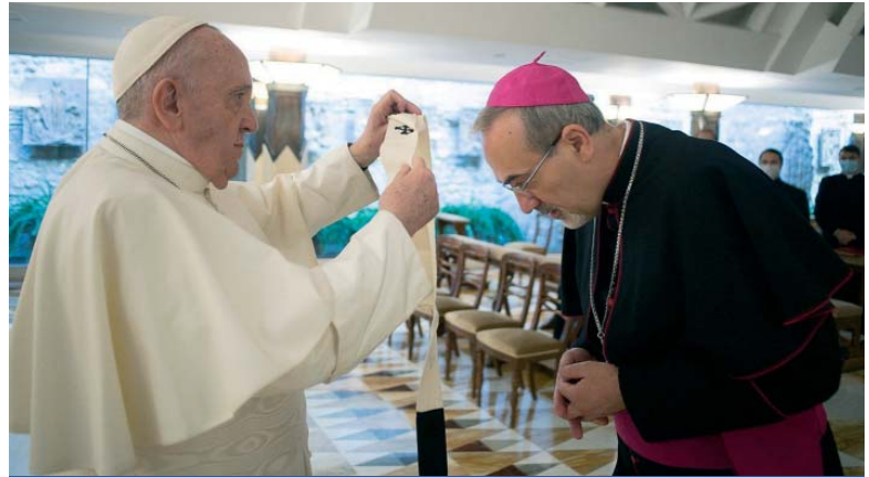
The Holy Father presented the pallium to the new Patriarch of Jerusalem, during a mass celebrated in the chapel of Saint Martha's House.

pastoral service and welcome his suggestions in order to be significantly involved in the vocation of Jesus' Land as an open and welcoming place, loved by all, where people and hopes coexist.