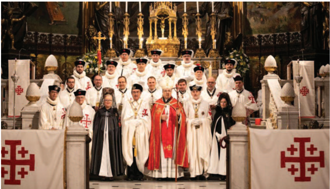
Madrid, Spain, October 27-28, 2023