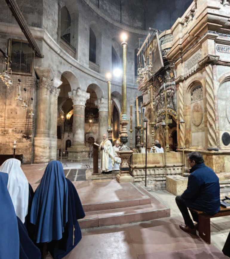
Mass celebrated by the Grand Master at the Holy Sepulchre.