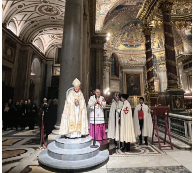
Rome, Italy, December 15-16, 2023