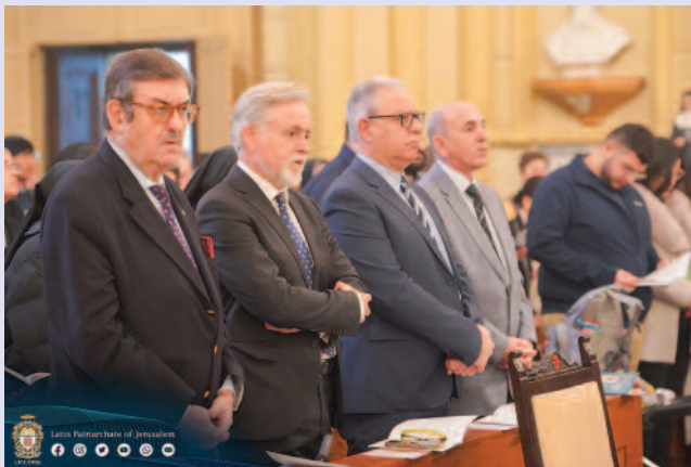
Mass for the World Day of Peace, on the feast of Mary Mother of God, was concelebrated by the Grand Master in the Pro-Cathedral of the Latin Patriarchate in Jerusalem.

In the afternoon, the delegation participated in the traditional daily procession organized by the Franciscan friars to the Basilica of the Holy Sepulchre, on the Sites of the Passion, Death and Resurrection of the Savior. Humbly, among the few pilgrims present – with a lit candle in his hand – Cardinal Filoni meditated at the foot of Calvary, near the stone where the body of the Crucified One was anointed, in front of the empty tomb and at the spot, marked by a large circle on