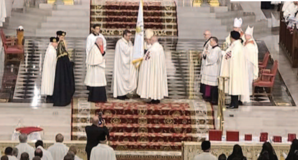
New York, United States, October 13-14, 2023