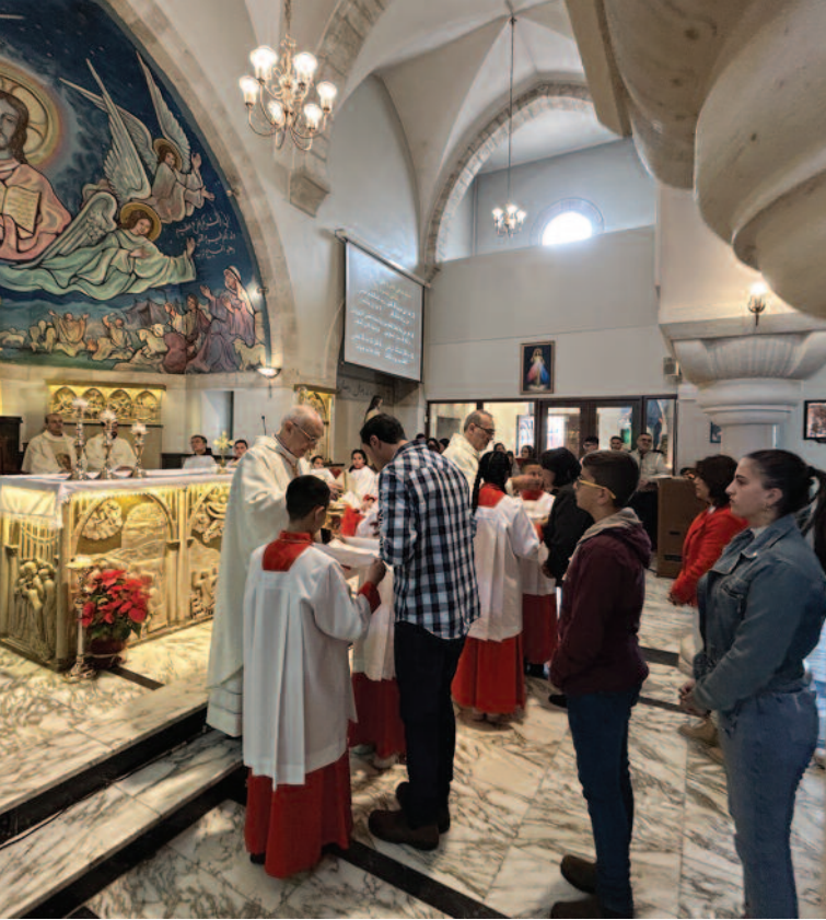
Sunday Mass of the Holy Family at Beit Sahour, the village built where the angels announced the birth of the Messiah in Bethlehem.