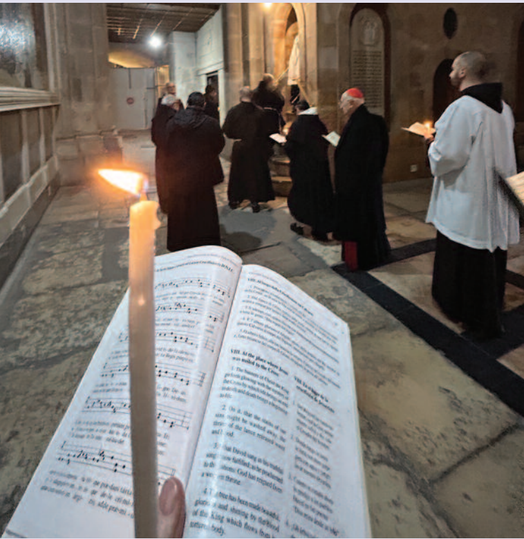
Cardinal Filoni took part in a procession organized daily in the Basilica of the Holy Sepulchre, led by the Franciscans in charge of the holy place, to the sites of the Savior's passion, death and resurrection.

Asylum Seekers then took place at the Saint Rachel Center in Jerusalem, where the children of these people are cared for during the day by the Vicariate. Also with the help of the Order, the Latin Patriarchate provides pastoral and social support to 70,000 foreign Catholic workers in very precarious situations in Israel, mainly from Asia and Africa.