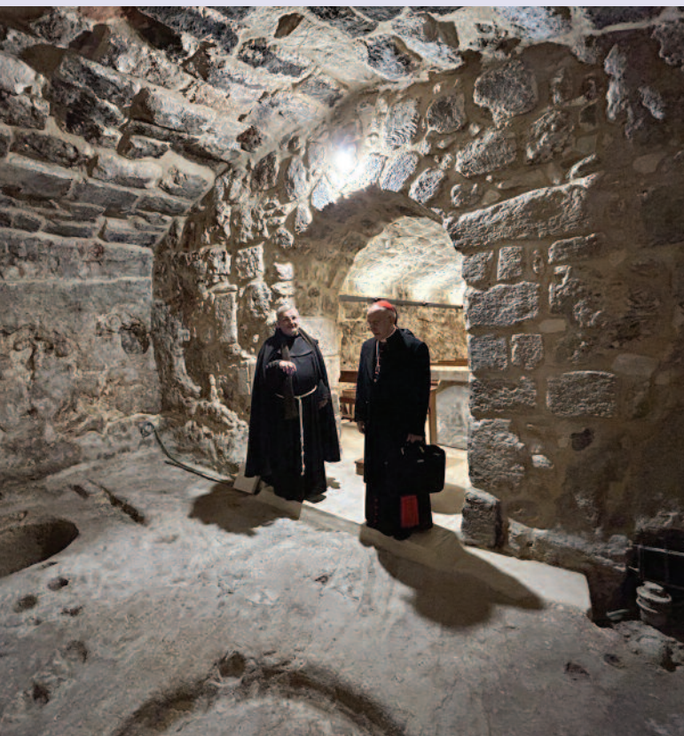
Visit to the "bowels" of the Basilica of the Holy Sepulchre with a Franciscan friar of the Custody.