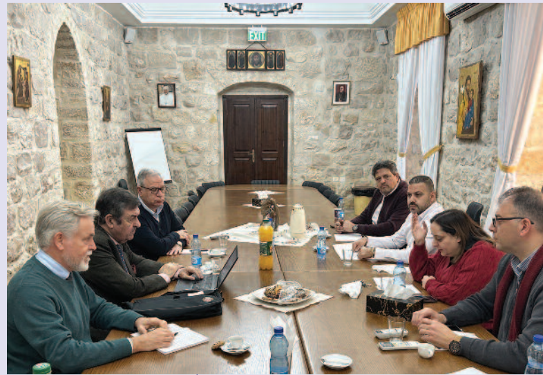
Working meeting of the Patriarchate's administrative team with the Governor General.

Christian families supported by the Patriarchate who live in very small apartments in the Old City of