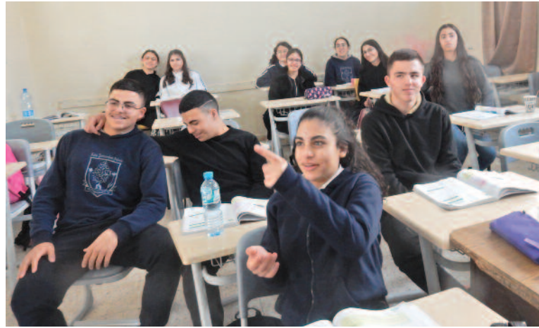
Education is a priority for the Latin Patriarchate, supported in its work by the Order of the Holy Sepulchre.

An emerging concern among parishes and schools is in the “Projects” which have become part of the expectation for developing the institutions of the Holy Land. The uncertainty surrounding these has been a considerable cause for concern. There needs to be a more transparent and effective process of funding projects within the overall work of the Patriarchate. Some mechanism will be further discussed to enable projects to take place.