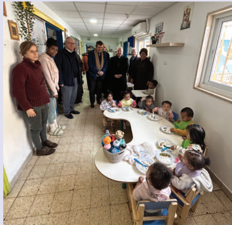
Visit to the Saint Rachel Center in Jerusalem, which is part of the Vicariate for Migrants and Asylum Seekers.

A visit by the Vicariate for Migrants and