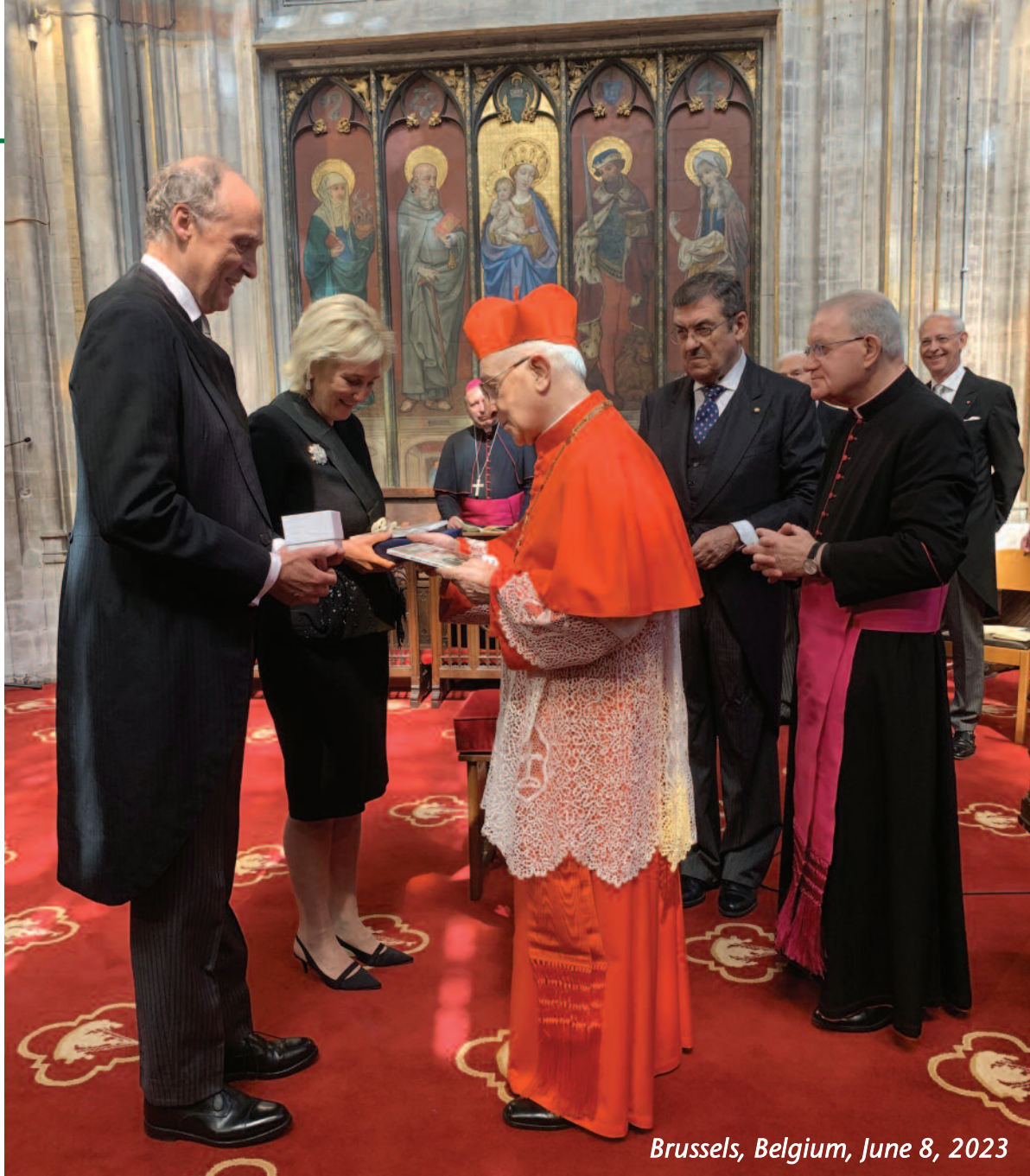
Brussels, Belgium, June 8, 2023