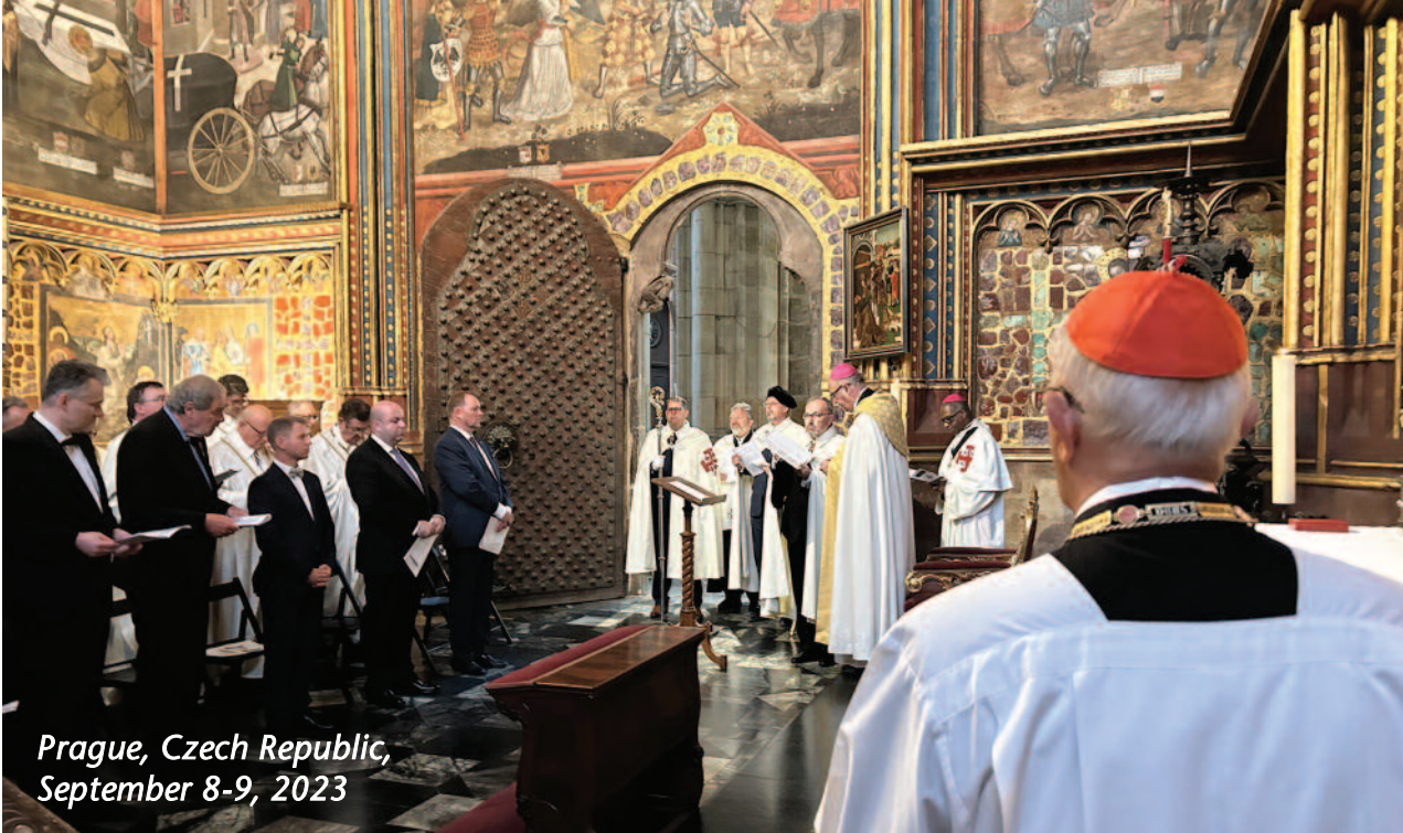
Prague, Czech Republic, September 8-9, 2023