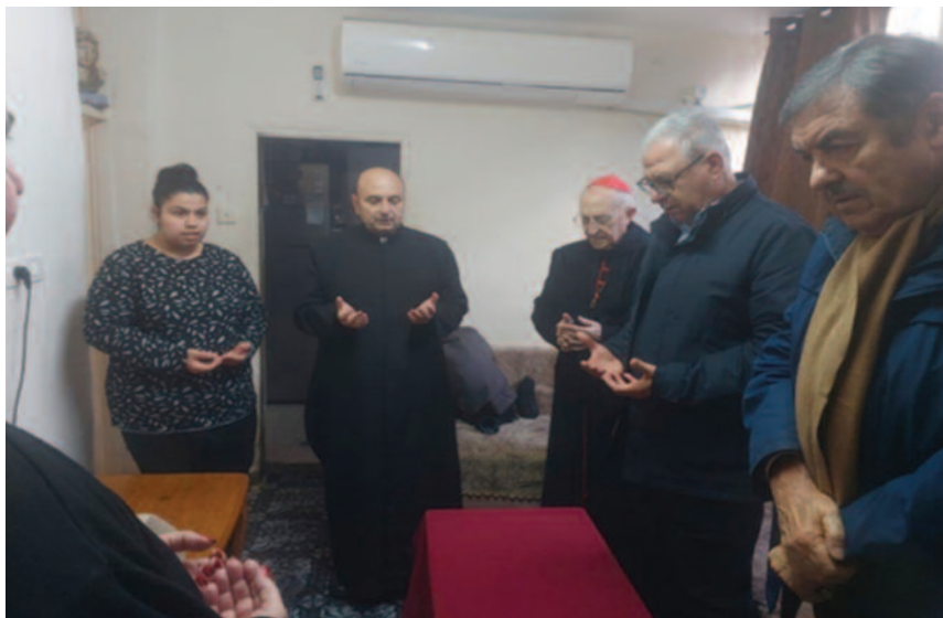
In each Christian family visited in Jerusalem, the Grand Master prayed after listening to the people in difficulty and assuring them of the support of the members of the Order.