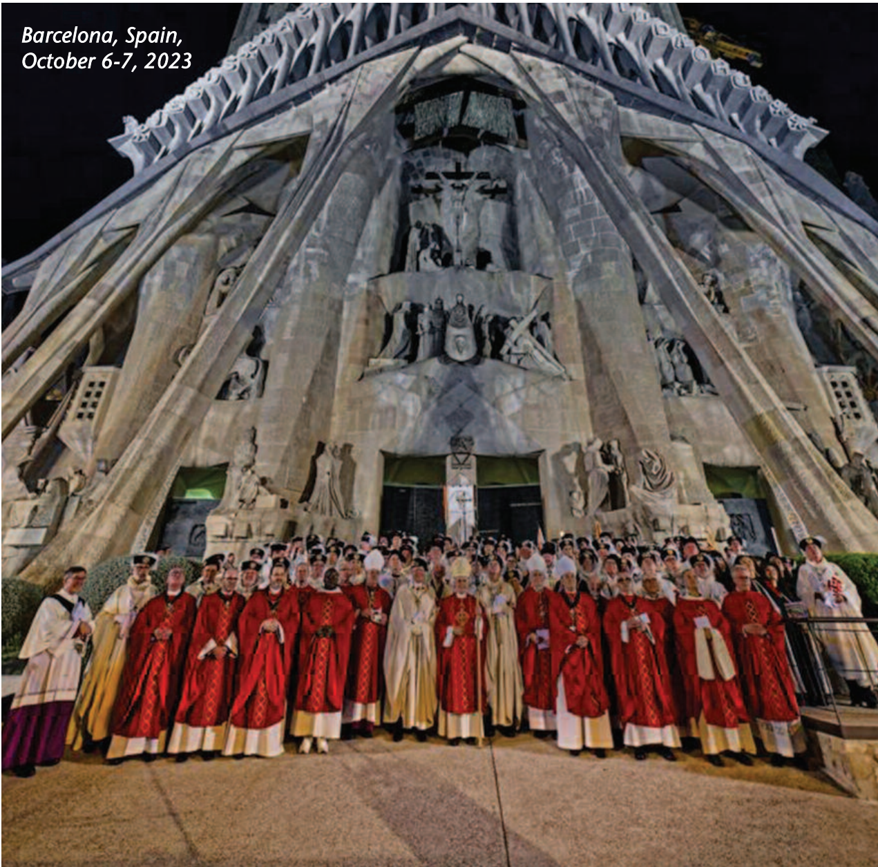
Barcelona, Spain, October 6-7, 2023