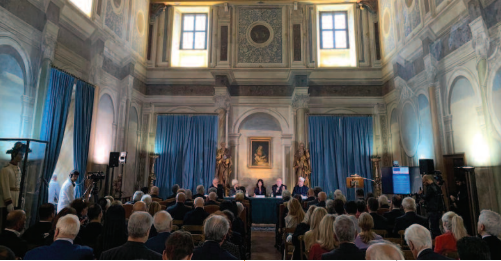
A large audience attended the interfaith symposium held at the Order's headquarters in Rome on May 11, 2023.