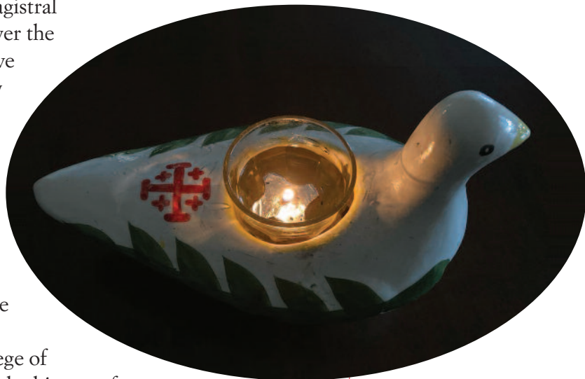
This oil lamp is a gift the parish of Taybeh made to the Grand Master and will burn in his chapel until there is peace in the Holy Land