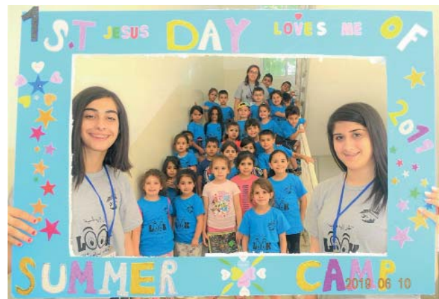
Summer camps for children are an integral part of small humanitarian projects financed by the Order of the Holy Sepulchre in 2019.