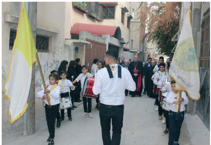
A visit by the Apostolic Administrator of the Latin Patriarchate of Jerusalem to Gaza. This Palestinian territory where the population is in a condition of extreme suffering is generously supported by donations from the Order of the Holy Sepulchre.