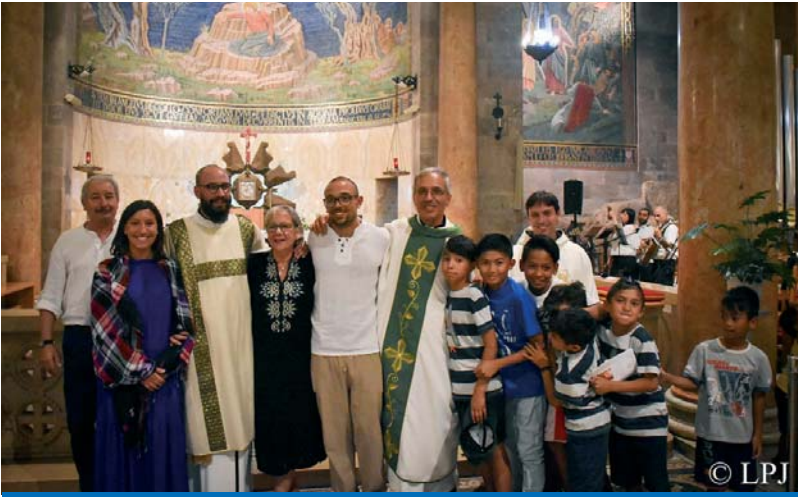
With the help of the Order of the Holy Sepulchre, the Saint James Vicariate for Hebrew speaking Catholics, as well as the Vicariate for migrants and asylum seekers have prepared the translation of liturgical and spiritual texts, intended for Catholic Hebrew speaking communities.

developed positive relationships and mutual acceptance despite the differences by demonstrating the ability to forgive and grow spiritually and socially". The initiative was a great success in the parish of Fuheis in Jordan where 800 children of all ages and 100 volunteers attended the summer camp. The purpose of the camp organized by the parish of Jifna