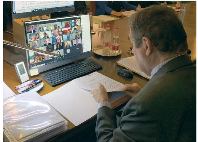
The Governor General Leonardo Visconti di Modrone during the virtual meeting with the North American Lieutenants.

In an interview with the North American Lieutenancies website, Governor General Leonardo Visconti di Modrone reminded members that for some time it will not be possible to go on pilgrimage to the Holy Land. Given that the financial sustenance of Christians in the holy places is linked to the tourism sector, how can we try to keep such an important support for them? The invitation – which extends to all Lieutenancies – is to allocate a part of what we would have spent on the pilgrimage to a solidarity fund: in this way it will be possible to continue offering the necessary help to those most affected by the economic