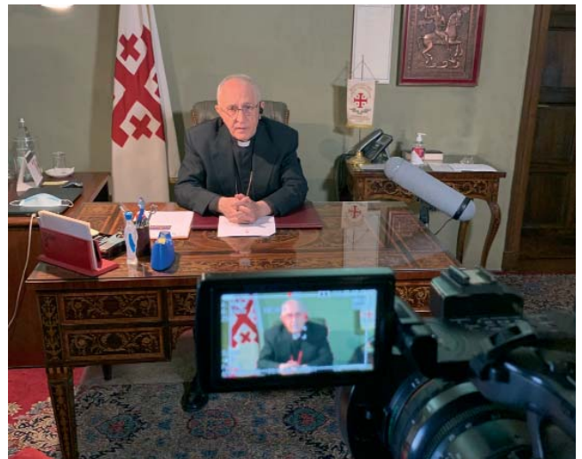
Cardinal Filoni is active in communications outreach to promote awareness of the vocation and mission of the members of the Order, as in this case, during a broadcast last Spring on the Italian public television channel Rai 1, from his Roman office at the Palazzo della Rovere.

Finally, an updated text of the Liturgy is being studied, as a concrete application of what had previously been mentioned, and with the aim of making our way of celebrating the Vigil of Prayer and the Investiture rite more appropriate