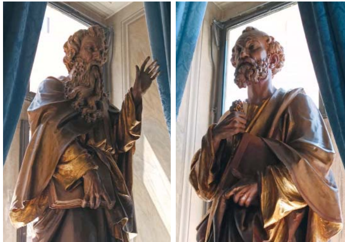
The statues of the apostles Peter and Paul – the pillars of the Church – dominate the hall of the Palazzo della Rovere, symbolizing the existential bond that unites the Order of the Holy Sepulchre with the universal Church.

On the occasion of the Second Session of the Second Vatican Council, Paul VI asked the question in the Council Chamber: Church, what do you say about yourself? Who are you? The dogmatic Constitution Lumen Gentium was born, in which the Council Fathers wrote: " Since the Church is in Christ like a sacrament or as a sign and instrument both of a very closely