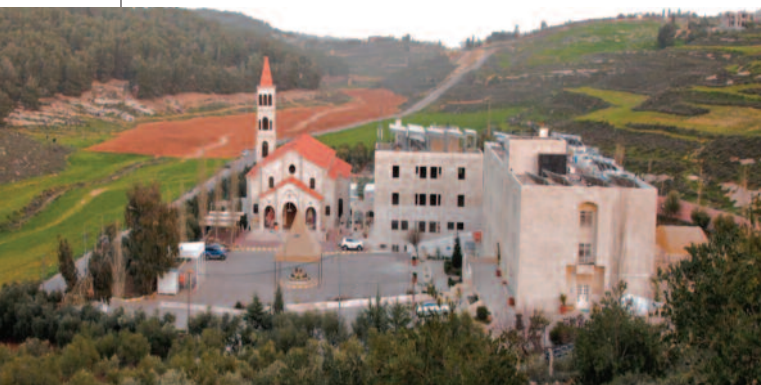
The Our Lady of Peace Center, Jordan.

Finally, near the Jordan River valley, built into the gorge of three hills, is the ancient