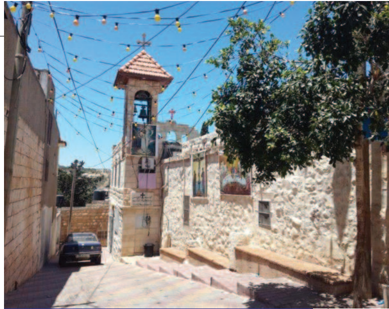
The parish of Zababdeh, Palestine, including many Christians.

The priests' house, which has been operating for decades, currently suffers from insulation problems that have caused plaster damage inside the building. In addition, the