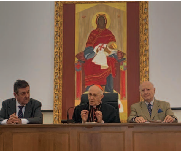
The Grand Master answered questions from Order members at the Investiture organized by the Lieutenancy for Sardinia, in the presence of the Governor General and the Vice Governor General for Europe.

years (a contract that can be revised every six years): this partnership will enable the Grand Magisterium to cover all the running costs of the Grand Magisterium, as well as the costs for the restoration and maintenance of the historic building, allowing donations from the Lieutenancies to be entirely donated to pastoral and humanitarian projects in the Holy Land. The controversy stirred up by some interests opposed to this agreement has been quelled thanks to transparent communication through the media, with the constant support of the Holy See's control bodies, the Governor General pointed out.