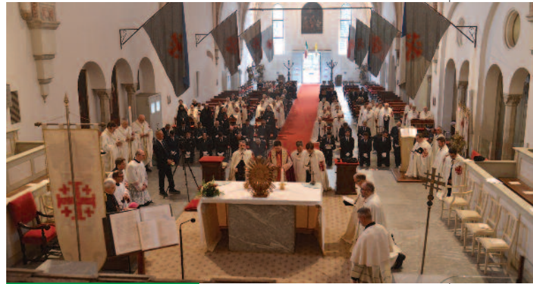
Above, the reception of new members in the church of Santa Maria della Pace, Milan.