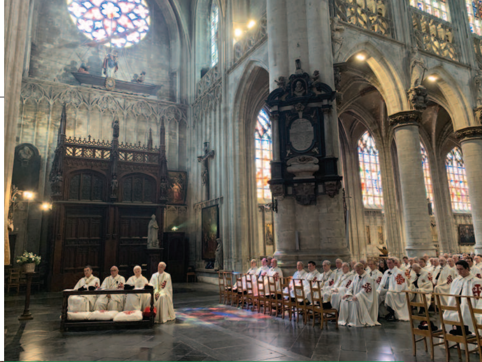
Investiture of new members in the church of Notre-Dame des Victoires in Brussels, in the presence of the highest authorities of the Order, on June 10.

receive today the insignia conferred on us by your Order," said the Princess, recalling that her family and country have always had excellent relations with the Holy See. "Under the reign of King Baudouin, Belgium played a very active role during the Second Vatican Council, thanks to Cardinal Suenens," she pointed out, recalling that thanks