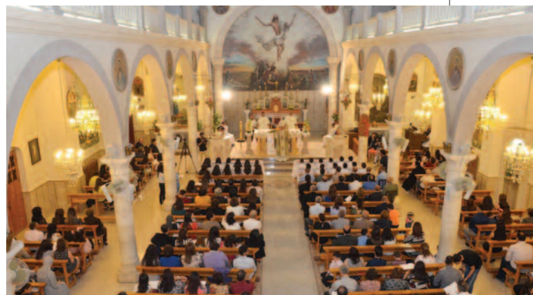
In Ramallah, Palestine, the Christian community participates actively.

In Ramallah, one of the most active communities in Palestine where many social and religious activities and celebrations, workshops, trainings, scout and youth meetings take place, the parish has a space of about 400 m 2 that houses rooms that can accommodate up to 400 people. Over time, maintenance and refurbishment of the sanitary facilities and some of the halls have become necessary, which, thanks to the contribution of the Lieutenancy for Luxembourg , can now be realized.