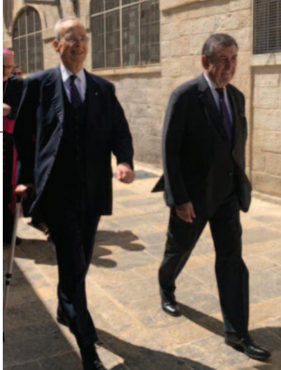
The Governor General and the current Lieutenant General of Honor walking side by side through the streets of Jerusalem during a trip to the Holy Land in May 2022.

We have known each other since we were in shorter pants. Our parents and grandparents were friends, probably so were our great-grandparents and great-great-grandparents, because our families, both from Milan, were bound by remote ties and very close to the Church.