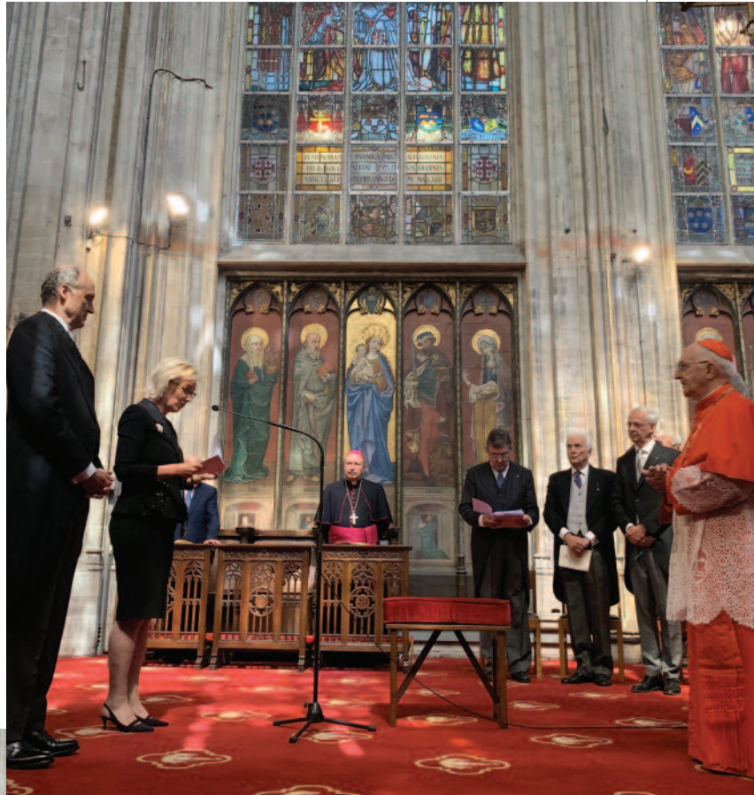
In the Order's chapter church in Brussels, the Princess and Prince of Belgium received the Order's insignia from the hands of the Grand Master.