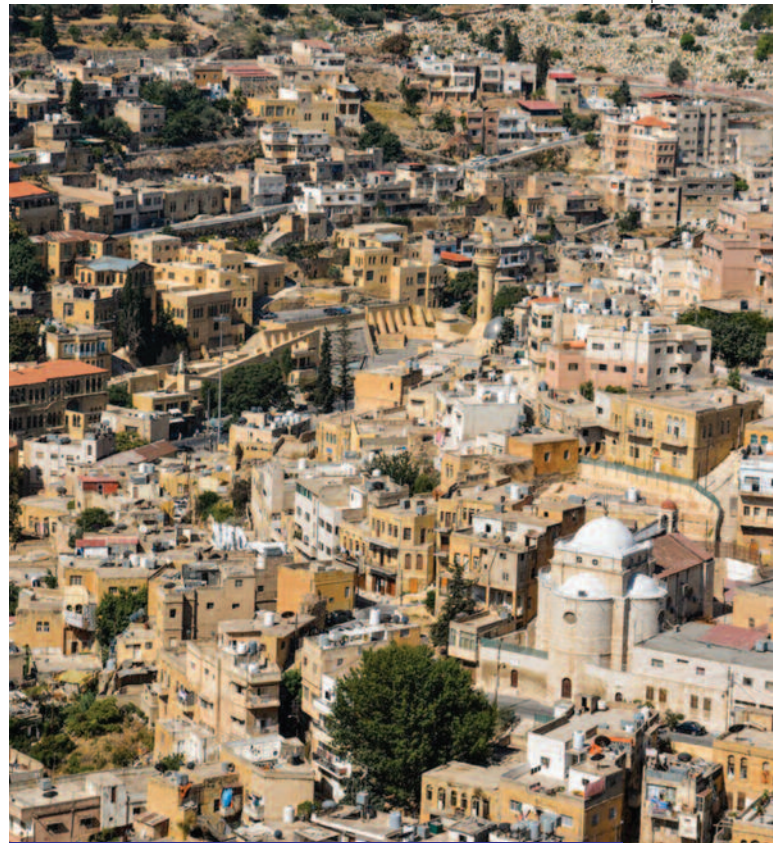
A view of As-Salt, whose historic centre is listed as a UNESCO World Heritage Site.

agricultural town of As-Salt where, in 1866, the Latin Patriarchate established the first parish in eastern Jordan, which included a school and a convent. Because of its cultural and natural richness, the historic center of As-Salt was listed as a UNESCO World