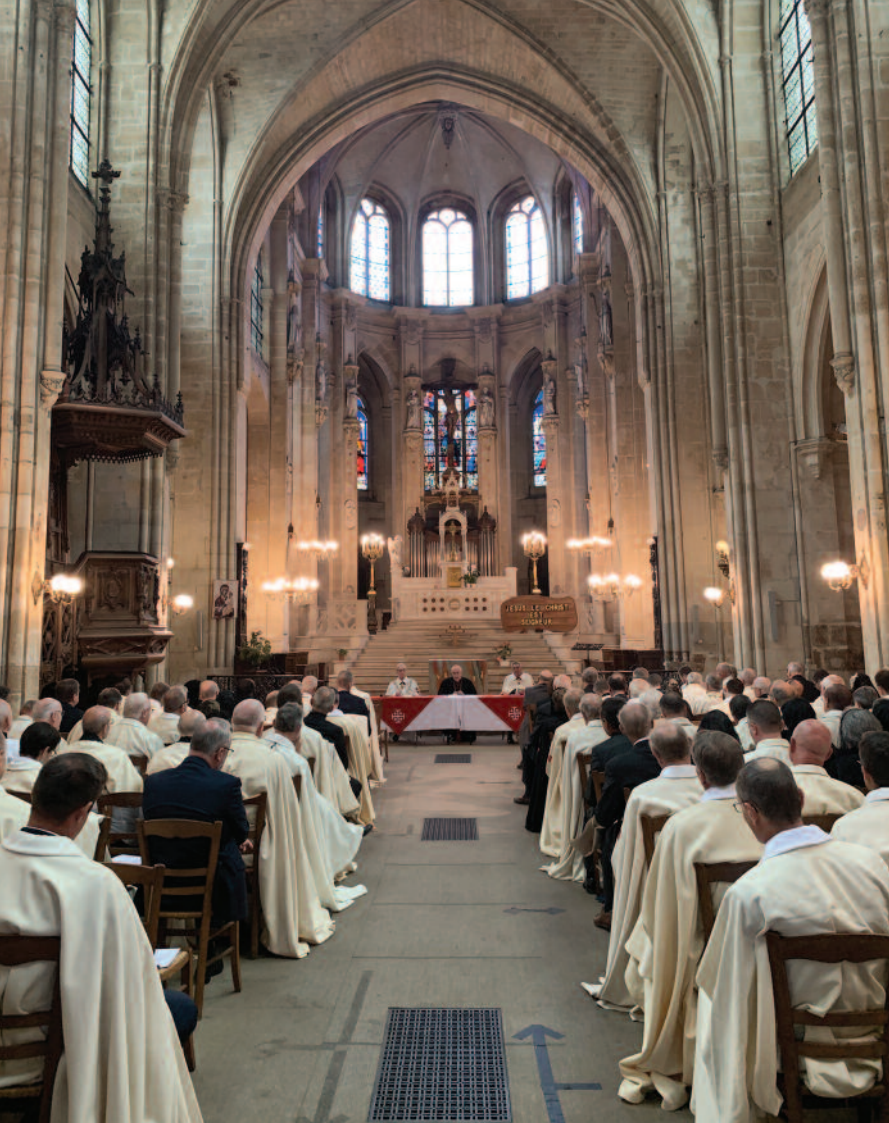
A meeting of the Lieutenancy for France with the Grand Master of the Order in the Saint-Leu-Saint-Gilles church in Paris in September 2022.

function. However, the Knights did have at their disposal the church of Saint-Roch and then the chapel of Notre-Dame du Salut for their celebrations, but apparently without the title of "capitular."