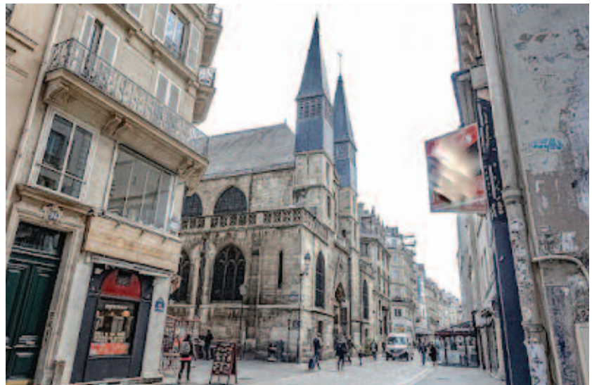
The relics of St. Helena, patroness of the Order, are venerated in Paris in the chapter church of the French Lieutenancy, located on Rue Saint-Denis.

Holy Week.” In reality, this custom had no real basis, as it was based solely on an exceptional authorization granted in March 1845 by Monsignor Affre, Archbishop of Paris, to ensure the custody of the Holy Crown in that year and, more generally, of the relics of the Passion. At the same time, the Knights were granted the possibility of continuing this service even when the relics were transferred to the Sainte Chapelle, a project that did not come to fruition. In fact, this custom for the custody of the relics during Holy Week would be granted again and permanently to the Knights in 1920. If the church of Notre-Dame de Paris and the Sainte Chapelle are mentioned, it is because, from the Revolution onwards, the Knights did not have an officially assigned place for the performance of their duties, and the latter two places could have filled this