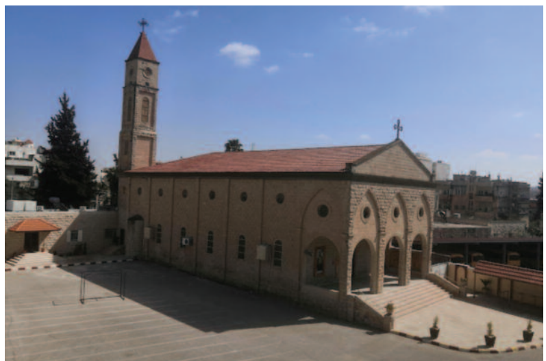
The church of St. Georges in Irbid, Jordan.

In Irbid, Jordan, a town of about 150 families, the Church of St. George the Martyr, which is an old structure, is in need